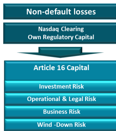
Figure 2: Nasdaq's Regulatory Capital covering non-default losses

In addition to the resources in the Waterfall, Nasdaq Clearing holds additional capital to cover operational & legal-, business- and investment risks in the CCP, as well as an orderly wind-down.